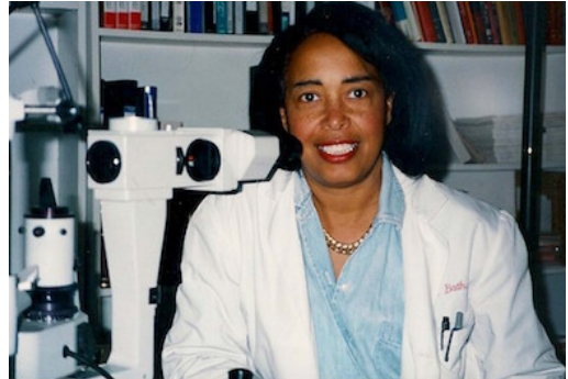
1942 – 2019 Dr. Patricia Bath – Inventor of Laser Cataract Surgery