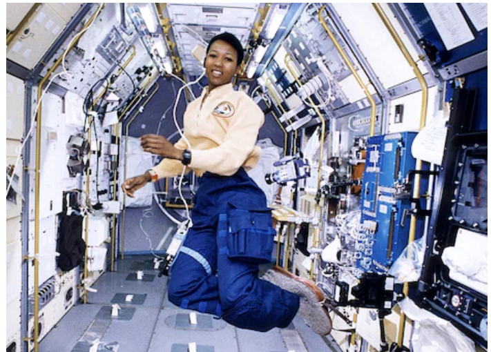
1956 – Mae Carol Jemison – The first black woman to travel into space