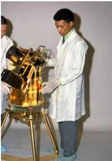
1929 – 2020 Dr. George R. Carruthers

Principal designer of telescope that went to the moon