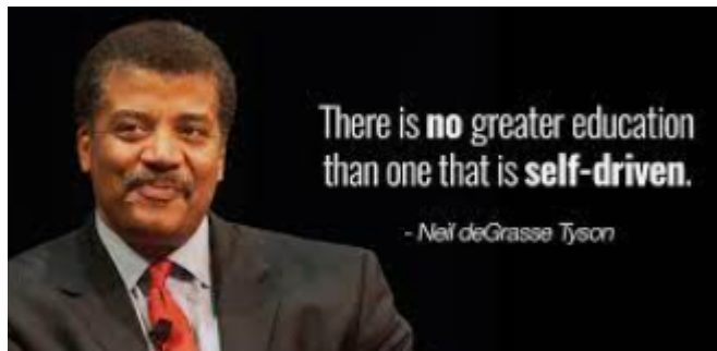
1958 – Neil deGrasse Tyson – American Astrophysicist, Planetary Scientist, Author, and Science Communicator